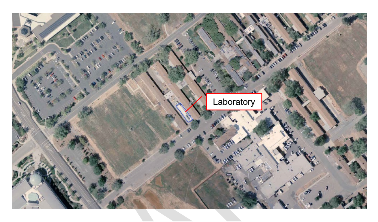
EXHIBIT A ACCESS AREA