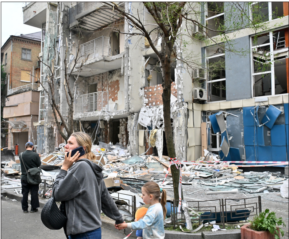
People on Sunday walk past a Kyiv residential building damaged in a drone strike. Russia has redoubled its aerial attacks on Ukraine as the U.S. in recent weeks has appeared to back away from efforts to secure a ceasefire.