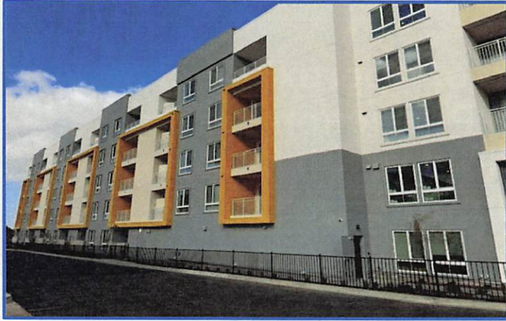
The Paul Downey Senior Residence located in Clairemont Mesa