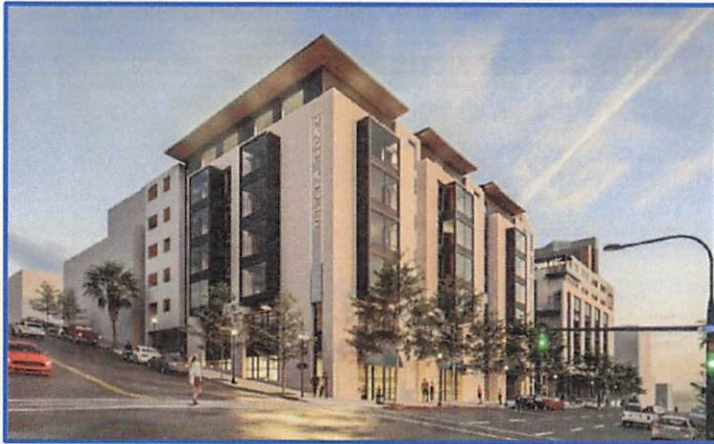
Rendering of Kindred Apartments to be located in Downtown San Diego