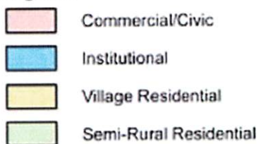
Figure IV.1 Specific Plan Zoning Map