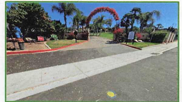
Completed Sidewalk project at East 32 nd Street, Lincoln Acres