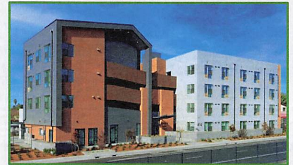
Santa Fe Senior Village Affordable Housing development located in Vista