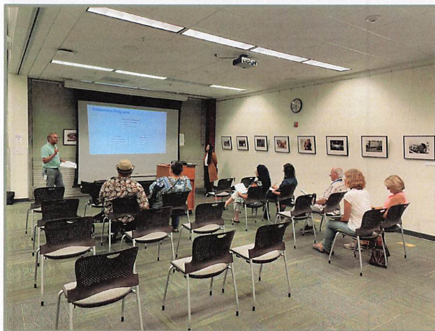
In-Person Community Input Session