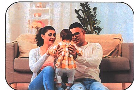
Child and Family Services